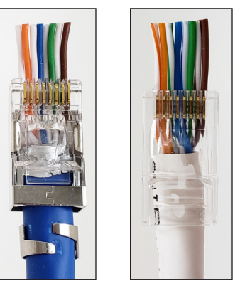
Flush cut with FT-45™ Tool

Minimized untwisting of pairs, only 1/4"