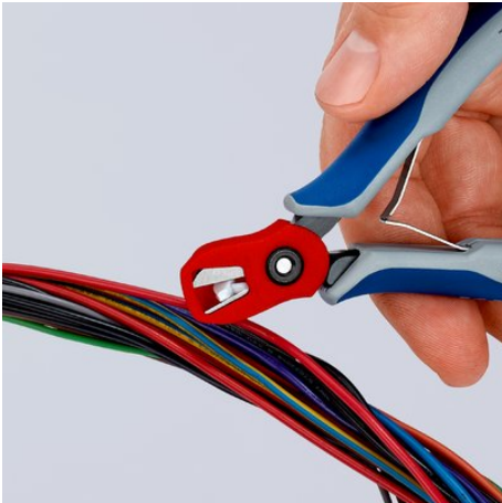
...the detached workpiece remains safely in the material catcher