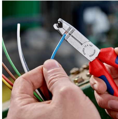
wire stripping holes for 1.5 and 2.5 mm 2 conductors