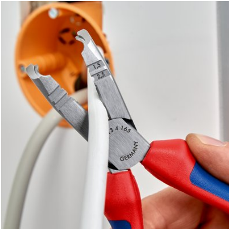
Cutting of cables of up to \varnothing 13 mm