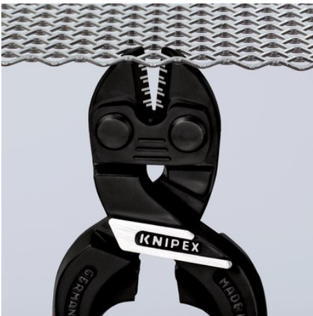
Slim head for ideal accessibility