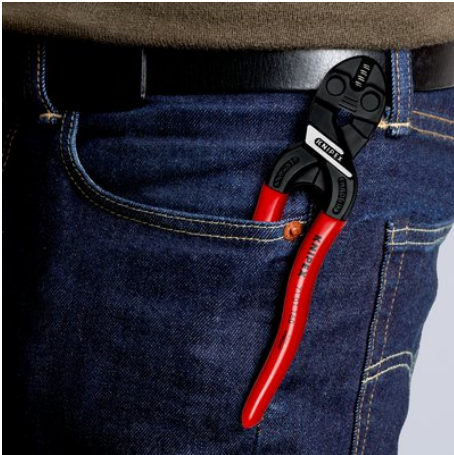
Compact, light and always to hand