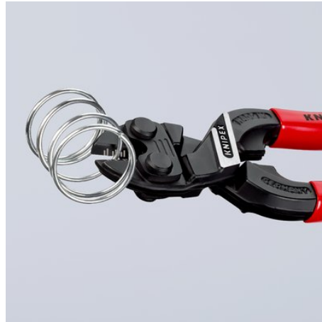
Powerful through to the tips