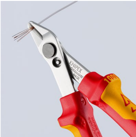
For use on live parts of up to 1000 V