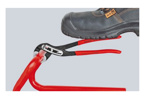
Self-locking on pipes and nuts: no slipping on the workpiece; the complete actuating force can be used to turn the workpieces; not having to squeeze the pliers handles reduces the required effort