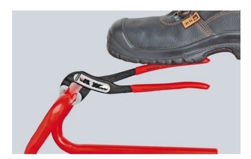
Self-locking on pipes and nuts: no slipping on the workpiece; the complete actuating force can be used to turn the workpieces; not having to squeeze the pliers handles reduces the required effort