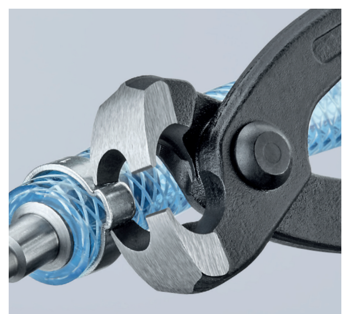
10 99 I220: The side jaw also permits good accessibility to the ear clamp in confined areas