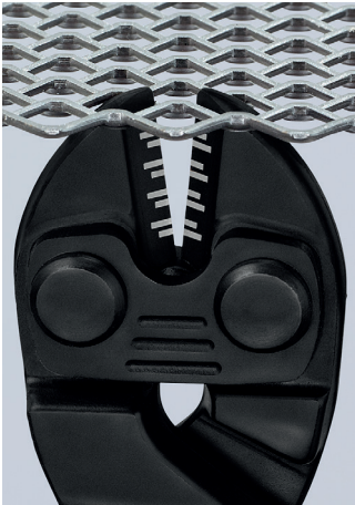
Slim head for ideal accessibility