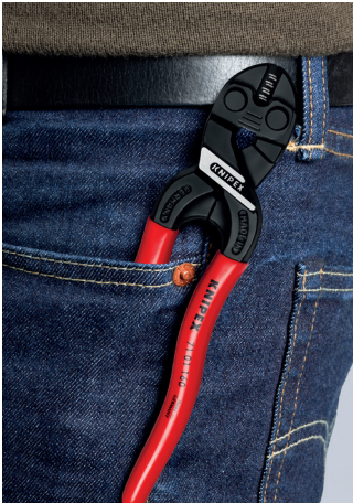
Compact, light and always to hand