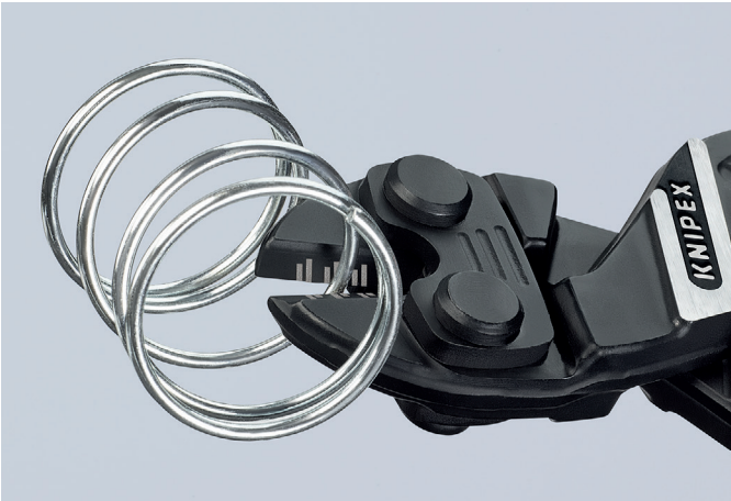
Powerful through to the tips

71 01 250 Also for two-hand operation: the 250 mm long KNIPEX CoBolt® XL cuts piano wire up to Ø 4.2 mm