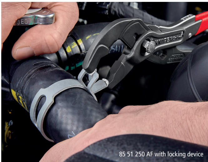
85 51 250 AF with locking device