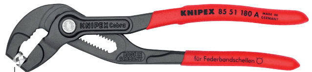
85 51 180 A