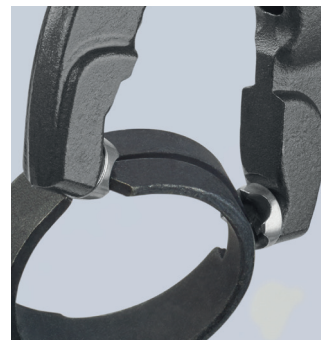
Spring band ring