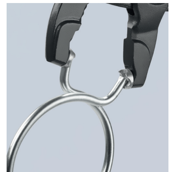
Spring wire hose clamp