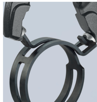
Spring hose clamp