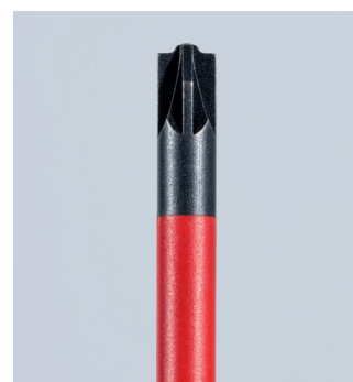
98 25 02 SLS: Pozidriv®/slotted