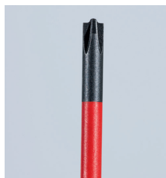
98 24 01 SLS: Phillips®/slotted