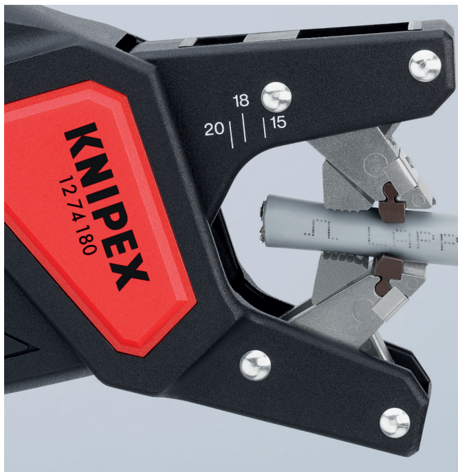
Required stripping length easy to read off