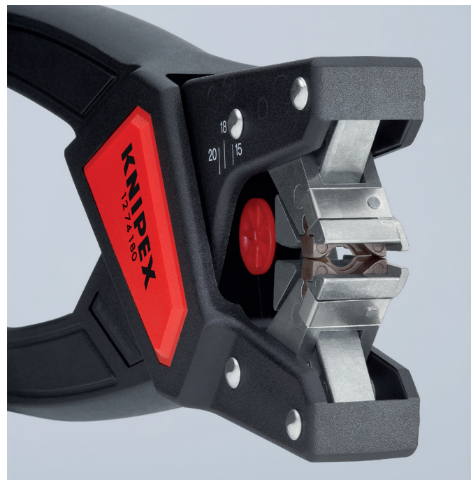
Complex cutter design for precise and damage-free stripping of round cables