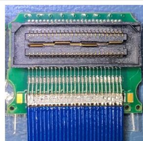
Figure 1. Assembly containing ribbonized cable built with green colorant in dielectric layer (Previous revision)

Drawing few indicating location of component color change.