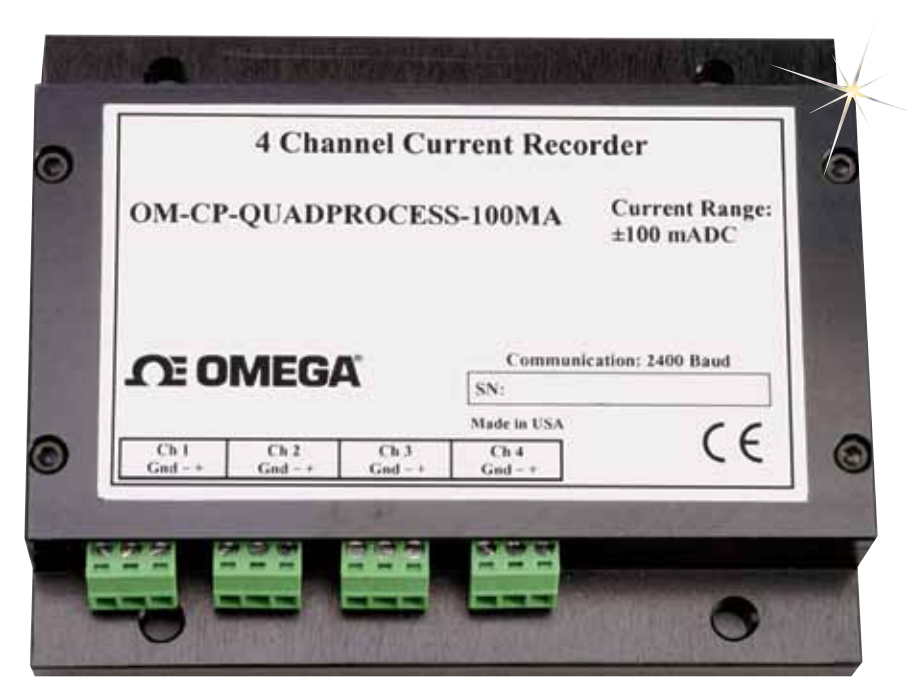
OM-CP-QUADPROCESS-100MA shown actual size.

The software converts a PC into a real-time strip chart recorder. Data can be printed in graphical or tabular format. It can also be exported to a text or Microsoft Excel file.