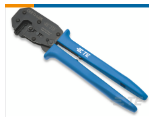
TE Part # 169400 CERTI-LOK