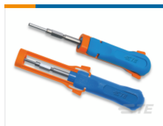
TE Part # 539972-1 EXTRACTION TOOL