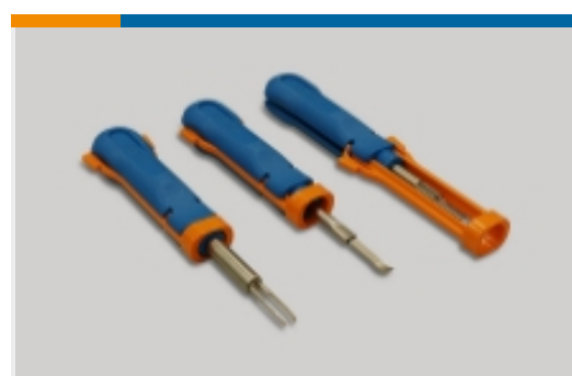
Insertion & Extraction Tools(4)