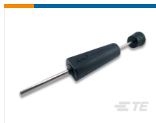
TE Part # 305183 EXTRACT TOOL TYPE 2 20-16