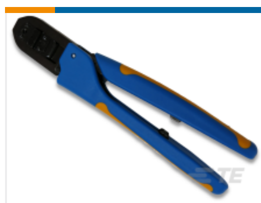
TE Part # 91523-1 CCII TYPE III+ PIN SKT 24-16 ASSY