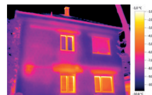
Thermal image with ScaleAssist