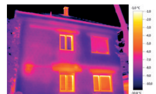
Thermal image with ScaleAssist