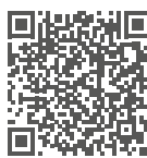
Application Android C.A 1510

Android-compatible application available from Play Store