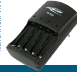
NIZN BATTERY CHARGER

Part no. 1001-0013 pu pieces 10 4 013674 021369