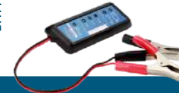
BATTERY TESTER CAR POWER CHECK

Part no. 4000002 pu pieces 16 4 013674 000029