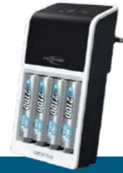
COMFORT PLUS + 4x AA 2100MAH

Part no. 1001-0094-01 pu pieces 20 4 013674 174416