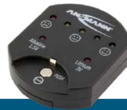
COIN CELL TESTER

Part no. 1900-0035 pu pieces 10 4 013674 039418