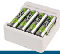
BASIC IV + 4x AA 1300MAH

Part no. 1001-0120-01 pu pieces 30 4 013674 178179