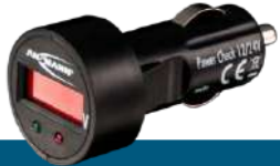
POWER CHECK 12/24V

Part no. 1900-0019 pu pieces 10 4 013674 021710