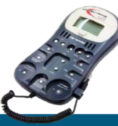
ENERGY CHECK LCD

Part no. 4000392 pu pieces 4 4 013674 000395