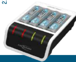
COMFORT SMART + 4x AA 2100MAH

Part no. 1001-0092-01 pu pieces 30 4 013674 171835