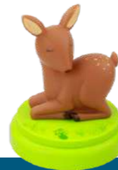
DEER MOBILE NIGHTLIGHT