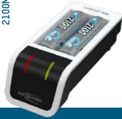
COMFORT MINI + 2x AA 2100MAH

Part no. 1001-0091-01 pu pieces 40 4 013674 171828