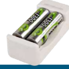
BASIC II + 2x AA 1300MAH

Part no. 1001-0119-01 pu pieces 30 4 013674 178162