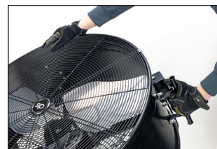
Swivel drum for directional airflow