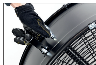
Pull handle for easy movement