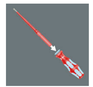
The VDE-insulated Kraftform Kompakt stainless blades are suitable for the 3817 VDE Stainless handle.