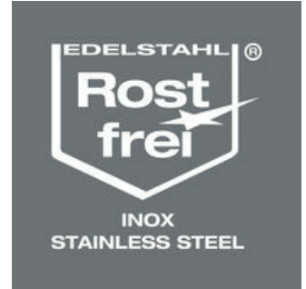
Solution to the rust problem: screwdriving stainless steel together with stainless steel! Wera stainless steel tools are manufactured out of stainless steel so unsightly rust can be avoided.

Screw stainless steel together with stainless steel!