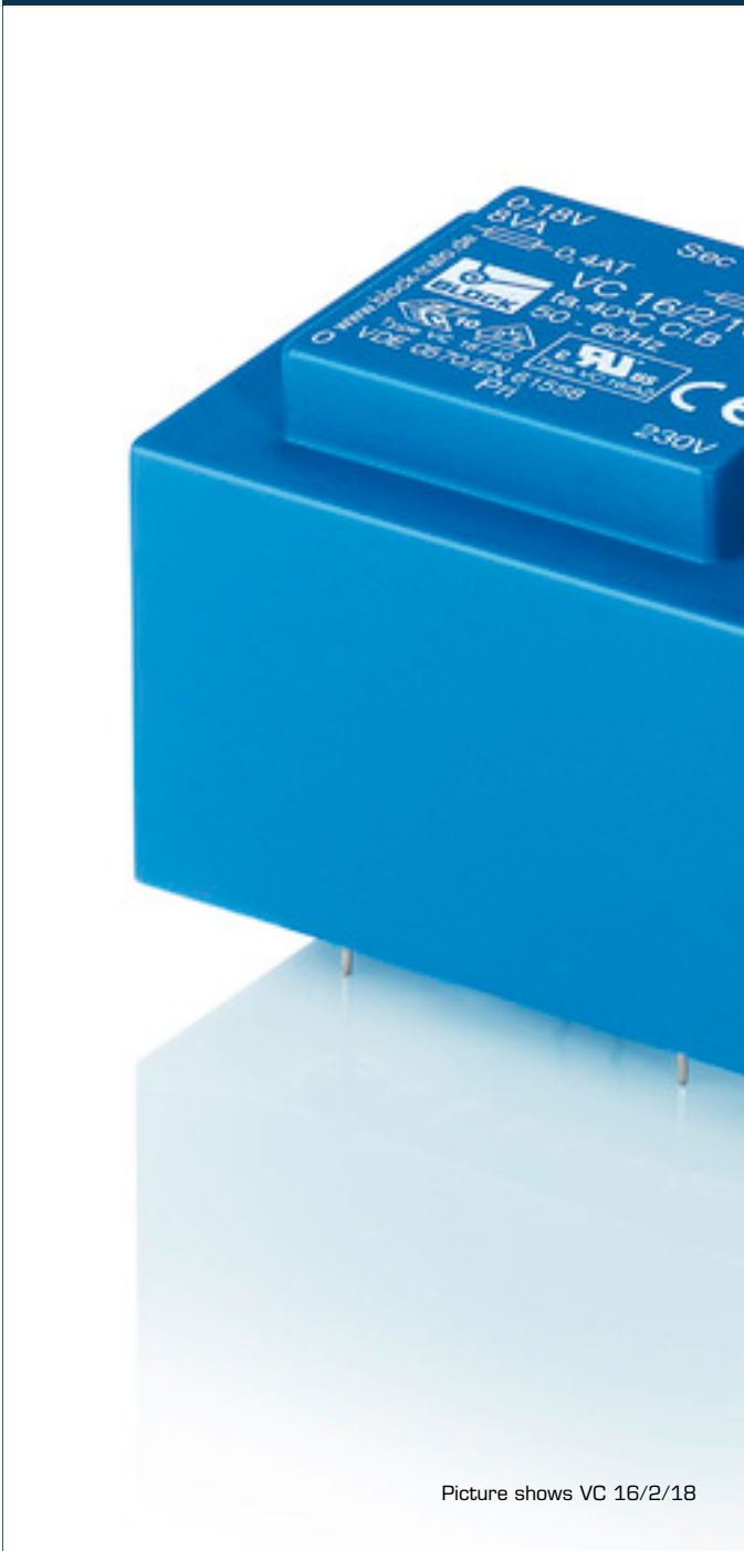
Picture shows VC 16/2/18