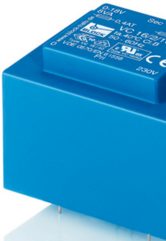
Picture shows VC 16/2/18