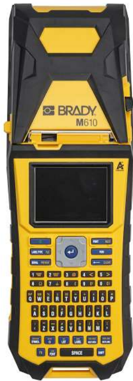
M610 Handheld Label Maker