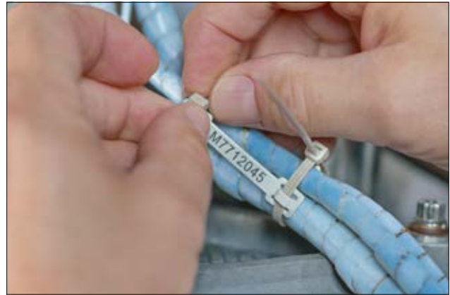
Outside serrated Cable Tie and Identification tag HFTP48 made from PEEK.