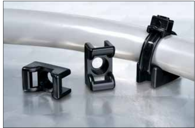
Cable Tie Mounts KR6G5, KR8G5 and CTM.