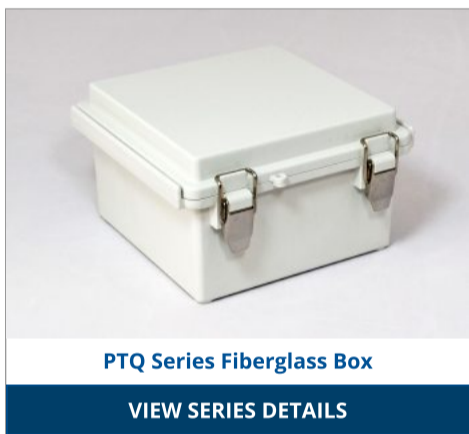
PTQ Series Fiberglass Box