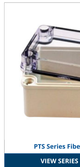
PTS Series Fiberglass Box