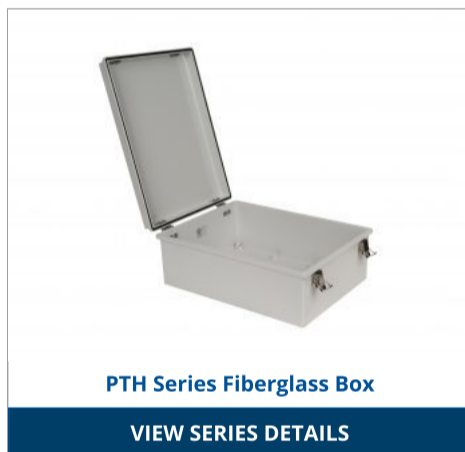
PTH Series Fiberglass Box