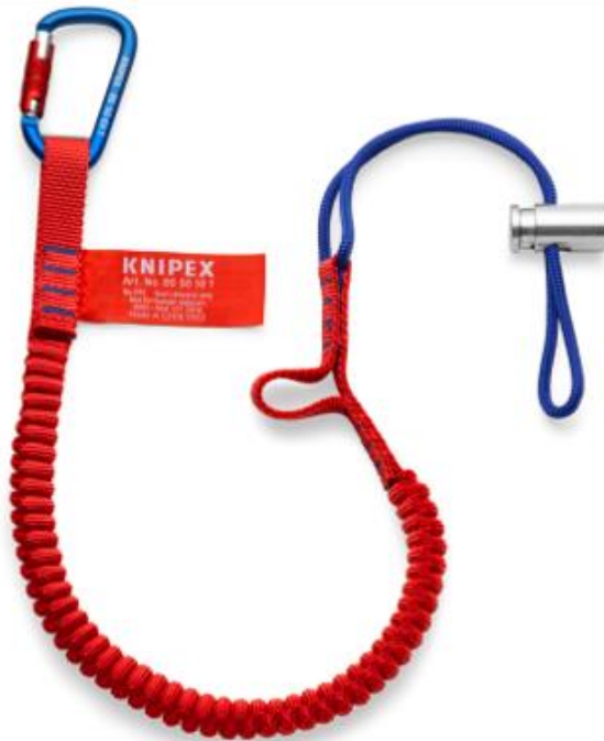
00 50 12 T BKA

KNIPEX now offers as ANSI/ISEA 121-2018 Compliant Lanyard and Adapter Strap. Designed for tools up to 13 lbs.