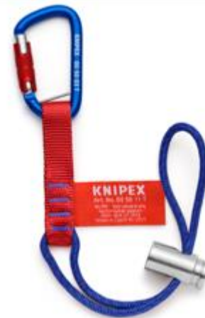
00 50 13 T BKA