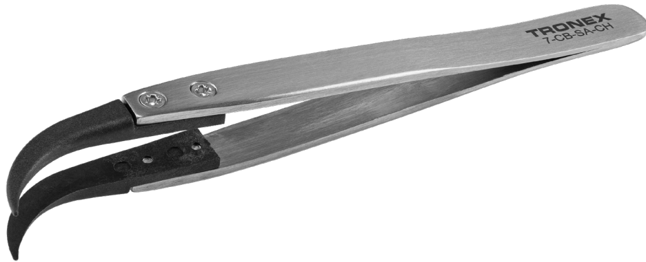
Replacement Tips Item: 7-CB-SA-RT