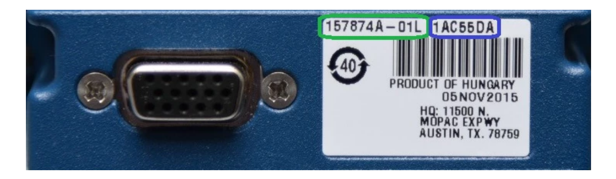
Figure 1: C Series Module backside showing part number highlighted in green followed by serial number highlighted in blue.

The assembly part number and revision of the C Series Module is printed on a label adhered directly to the back of the module. The part number should be formatted as a 10-character alphanumeric string ######<REV>-#<VER>L. For example, a valid part number would be 157874A-01L. In this example, the board would be revision A and version 1.