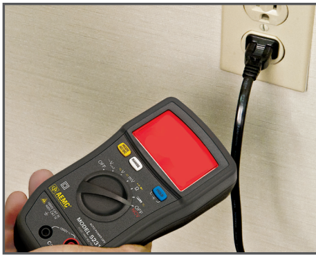
Non-contact detection of network voltage (NCV Function-AC only)