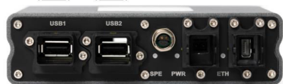
periMICAs modular hardware (F2 | P2 | S3)