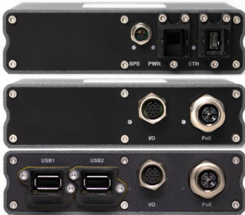
periMICAs fronts (F3|S3, F2|S1, F3|S3)