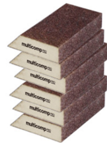
one angled and four side coated