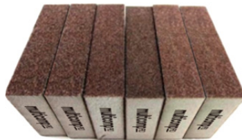
four side coated