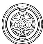
Conn.1 Pin Assignments Front View