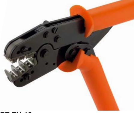
PZ ZH 16