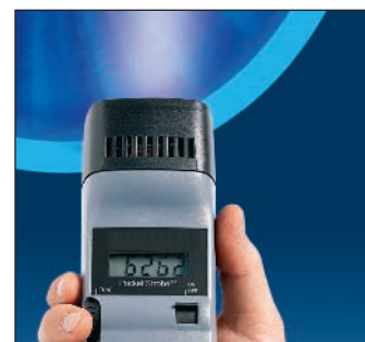
rpm measurement in a turbine, for example