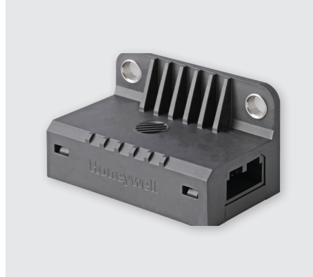
BAS Series Battery safety aerosol sensor