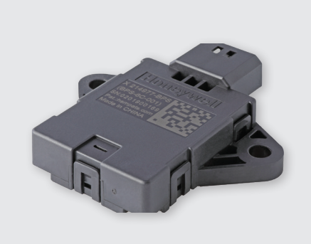
BPS Series Battery safety pressure sensor