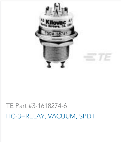
TE Part #3-1618274-6 HC-3=RELAY, VACUUM, SPDT