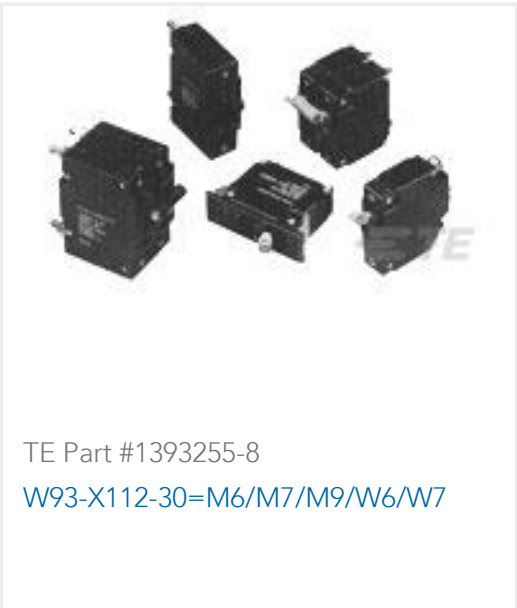
TE Part #1393255-8 W93-X112-30=M6/M7/M9/W6/W7