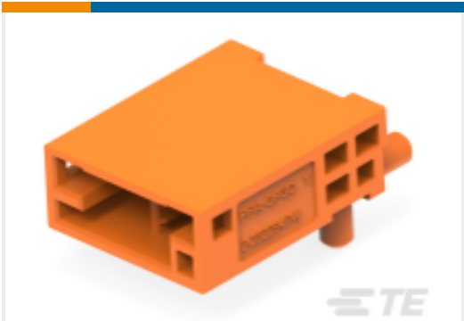
TE Part #2-2322946-5 2POS,TAB0.63X0.63,HDR ASSY,90DEG