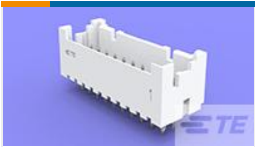
TE Part #2-1969582-0 ASSY, HDR, VERT, NO-BOSS, DUAL ROW,EP2.5