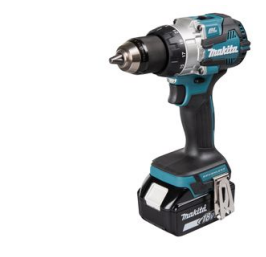
Hammer Driver Drill LXT® DHP489