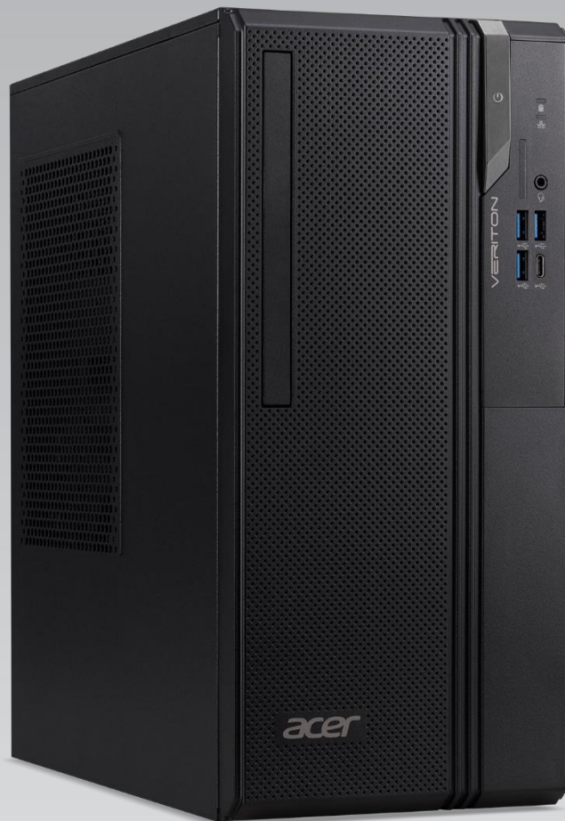
Veriton 2000 Mid Tower