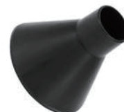
Suction bell MPXXXX