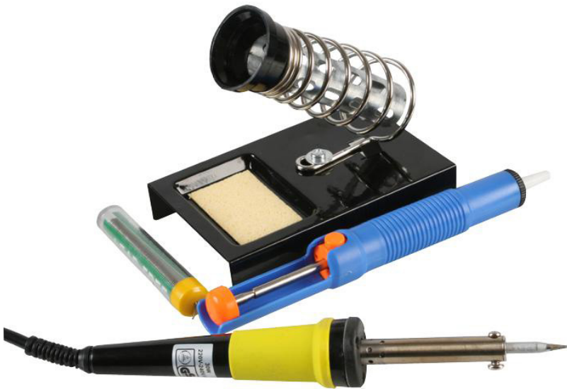
Soldering Kit Model: D01855