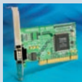
UC-246 uPCI 1xRS232