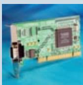
UC-235: LP uPCI 1xRS232