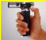
KILL OFF SWITCH