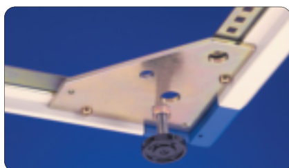
Universal corner bracket with jacking foot standard with frame type 'A' & 'B'

Each Caster Kit includes four (4) locking casters and hardware.