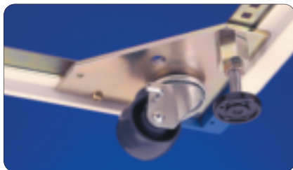
Caster installed with jacking foot