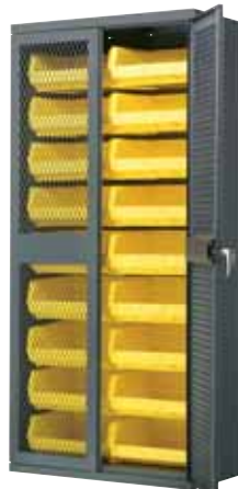
Secure View Security Bin Cabinet Steel mesh door panels; louvered back wall panel holds up to 36 bins