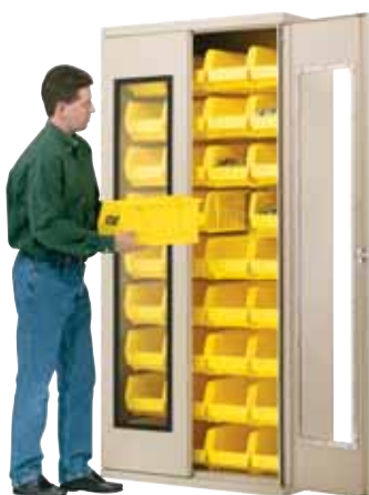
Quick-View Security Bin Cabinet Lexan™ door panels; louvered back wall panel holds up to 36 bins