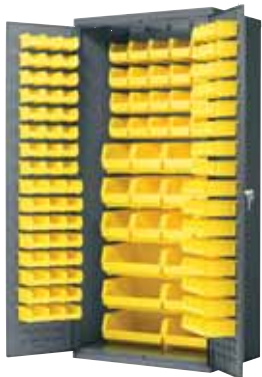
AkroBin Cabinet Louvered panels on back wall and doors hold up to 138 bins