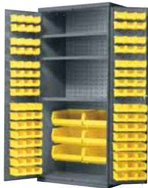
AkroBin Cabinet with 3 Shelves Louvered panels and 3 full (24") shelves hold up to 102 bins