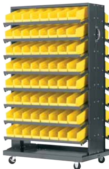
Double Sided Pick Rack & Mobile Kit Creates a mobile double sided pick rack Maximum 500 lb. weight capacity