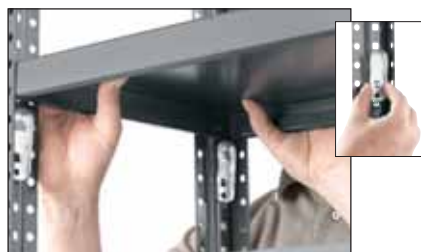
Easy Shelf Adjustment: Quickly change shelf height with compression clips

350 pound capacity per shelf when assembled and installed per instructions.