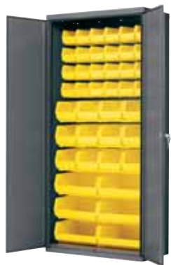
AkroBin Cabinet with Flush Doors Louvered panel on back wall holds up to 42 bins