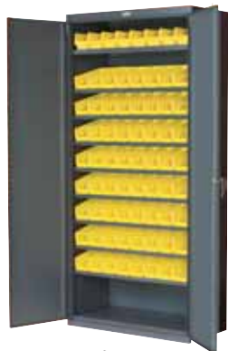
Shelf Bin Pick Rack Cabinet