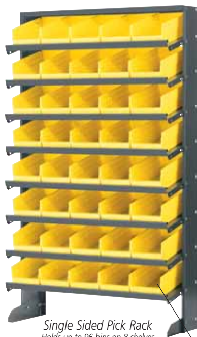
Single Sided Pick Rack Holds up to 96 bins on 8 shelves Maximum 400 lb. weight capacity

Angled shelves increase picking efficiency