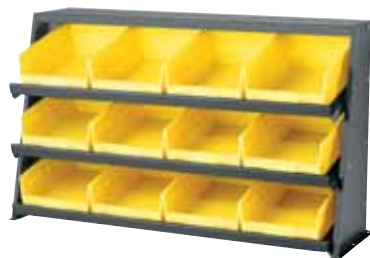
Bench Pick Rack Holds up to 24 bins on 3 shelves