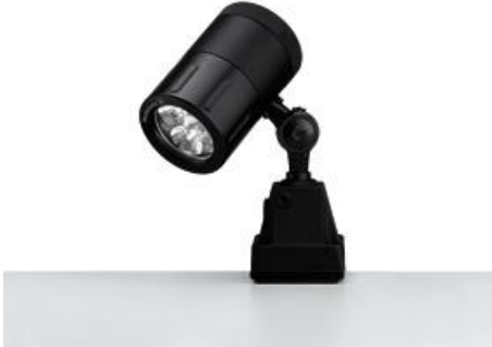
SPOT LED 003 - MCXFL 3 S

connected load fitted with work equipment mains lead luminaire body material surface weight (net) fastening technology usage lamp cover system of protection class of protection colour luminaire body special features article no.