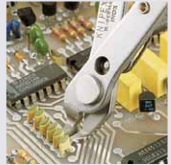
Angled blades for clean cut also in confined areas