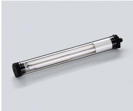
RL70CE- 136 H